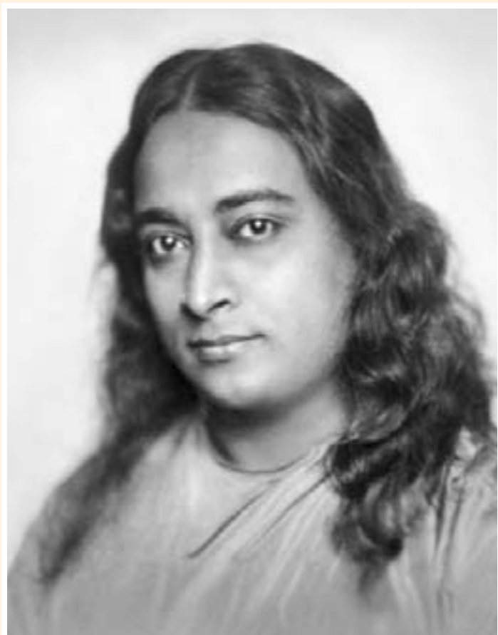
Paramahansa Yogananda (January 5, 1893–March 7, 1952)