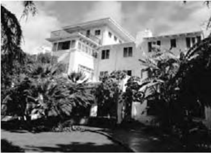
Administration building, Self-Realization Fellowship International Headquarters, atop Mt. Washington overlooking the city of Los Angeles