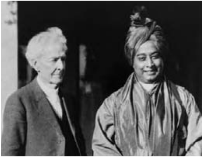
Luther Burbank and Paramahansa Yogananda