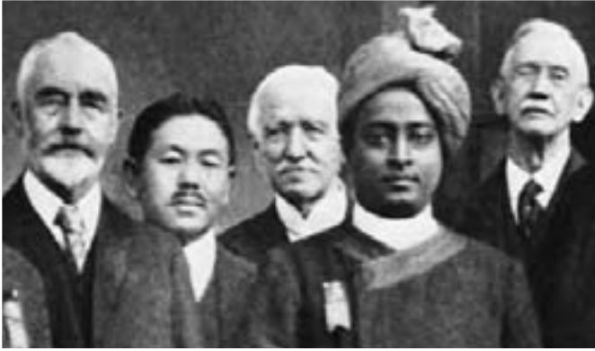
A few of the delegates to the International Congress of Religious Liberals, October 1920, Boston, Massachusetts, at which Yoganandaji gave his first speech in America.