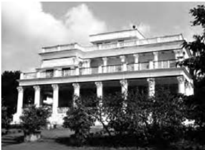
Yogoda Math, headquarters and publishing center of Yogoda Satsanga Society of India (Self-Realization Fellowship), Dakshineswar, Calcutta